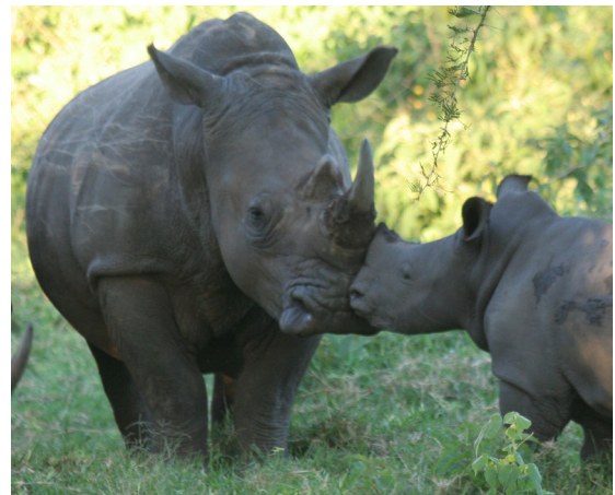
New calf Uhuru meets subadult male Justus for the first time.